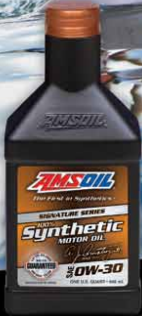
SYNTHETIC MOTOR OILS